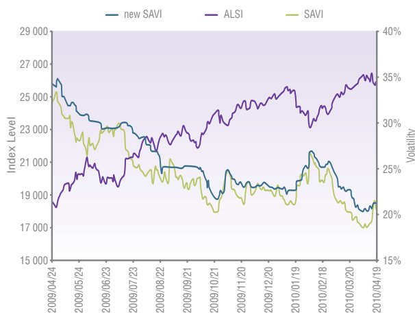
Figure 2. The SAVI and the new SAVI. The FTSE/JSE Top40 index level is also plotted. The new SAVI is slightly different to the SAVI due to the contribution of the skew in the new SAVI.

The SAVI was updated three years later, in 2010, to reflect a new way of measuring the expected 3-month volatility. The new SAVI is also based on the FTSE/JSE Top40 Index, but it is not only determined using the at-the-money volatilities but also using the volatility skew. Given that the volatility skew should incorporate the market's expectation of a crash, the new SAVI can be thought of as a more efficient "fear" gauge, since it incorporates a market crash protection volatility premium 5 .